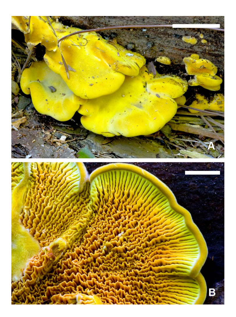
Fig. 2 – Basidiomes of Pseudomerulius curtisii related specimens on decayed wood of Pinus sp. A Pileus, upper view (DBB 1, SMDB 13.701), Scale bar = 2 cm. B Pileus, lower view showing folded lamellae (ICN 139784), bar = 0.5 cm.

the margin, (0.5-)1(-2) mm in width, P_m=1.21 , n=61/1; dissepiments thick, glabrous, smooth; margin yellow (8/6-7/8\ 10\text{YR}) , forming a sterile growing zone, felty, slightly incurved on hymenophore, fragile, easily bruised. Fold layer concolorous to the hymenophore, up to 3 mm thick. Context yellow (8/6-8/8\ 2.5\text{Y}) , paler than the folds, thick, up to 10 mm thick, homogeneous, fleshy, easily to macerate, with a slightly darker cortex formed by the felty, pilear surface.