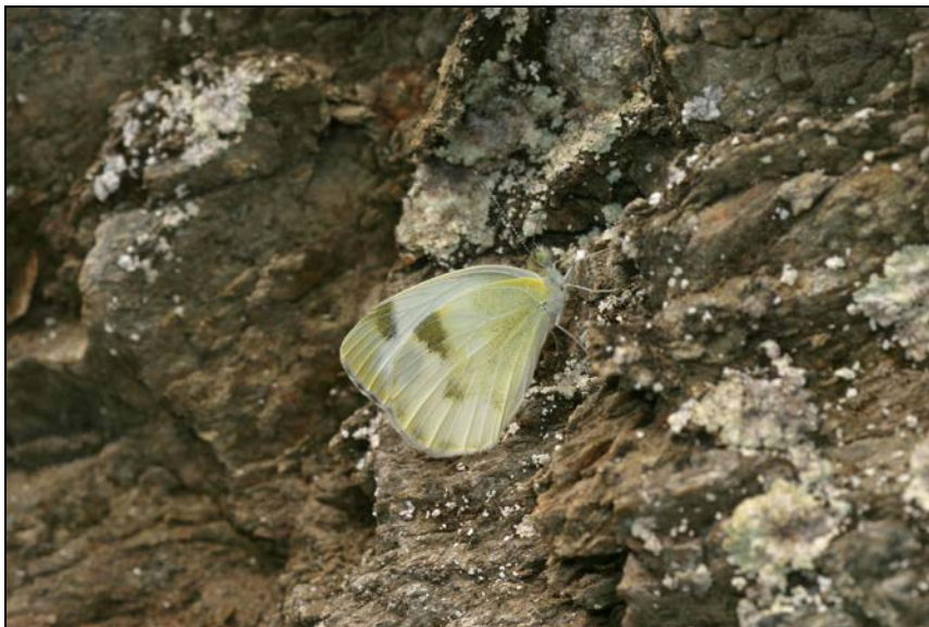
Figure 3. The Krueper's Small White ( Pieris krueperi ) has been found for the first time in the lower part of the Vardar Valley.

Slika 2. Sivček vrste Erynnis marloyi je v Makedoniji redka vrsta. Našli smo ga na dveh novih lokacijah.