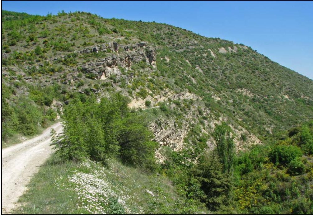
Figure 4. The gorge east of the village Besvica was one of the most interesting localities with 37 species observed, including rare species like: Plebejus sephirus , Tarucus balkanicus , Melitaea ornata , Carcharodus orientalis , and Erynnis marloyi.

Slika 4. Soteska vzhodno od vasi Besvica je bila ena izmed najbolj zanimivih obiskanih lokacij. Tu smo našli 37 vrst metuljev, med njimi tudi redke vrste: Plebejus sephirus , Tarucus balkanicus , Melitaea ornata , Carcharodus orientalis in Erynnis marloyi.