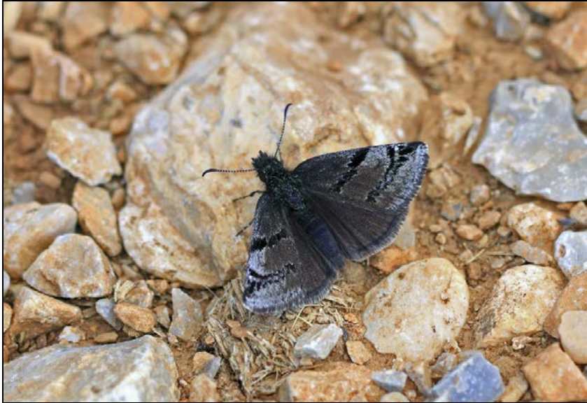
Figure 2. The Inky Skipper ( Erynnis marloyi ), a rare species in Macedonia, was found at two sites during the survey.

Slika 2. Sivček vrste Erynnis marloyi je v Makedoniji redka vrsta. Našli smo ga na dveh novih lokacijah.